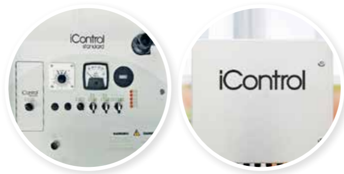
Each panel is housed in a stainless-steel enclosure.